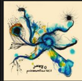
Jacky 0 – Psiconautica Vol.1